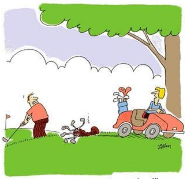
"OOOPS! Sorry about that!"

Your affiliation fee covers you for personal injury it does not cover you for damage to another players equipment. It is therefore recommended that you take out your own personal golfers insurance to cover you for damage to another player's equipment.